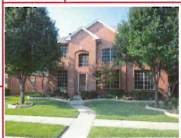
5613 Longhorn Drive The Colony, Texas

LEGEND - C.M.= Controlling Monument; F.I.R.= Found Iron Rod; F.I.P.= Found Iron Pipe; F.C.P.= Fence Corner Post. OHE=Overhead Electric. S.I.R.= Set Iron Rods 1/2" diameter with yellow cap stamped "Arthur Surveying Company". All found iron rods are 1/2" diameter unless otherwise noted. — x — (fence / fence post) — OHE — (overhead power)