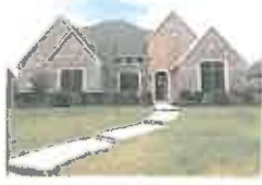
991 Fox Bend Way Prosper, Texas

SURVEYORS CERTIFICATION: The undersigned do hereby certify that this survey as this day made on the ground of the property legally described hereon and is correct, and to the best of my knowledge, there are no visible discrepancies, conflicts, shortages in area, boundary line conflicts, encroachments, overlapping of improvements, easements or rights of way that I have been advised of except as shown hereon. The bearings shown hereon are based on the above referenced recorded map or plat unless otherwise noted.